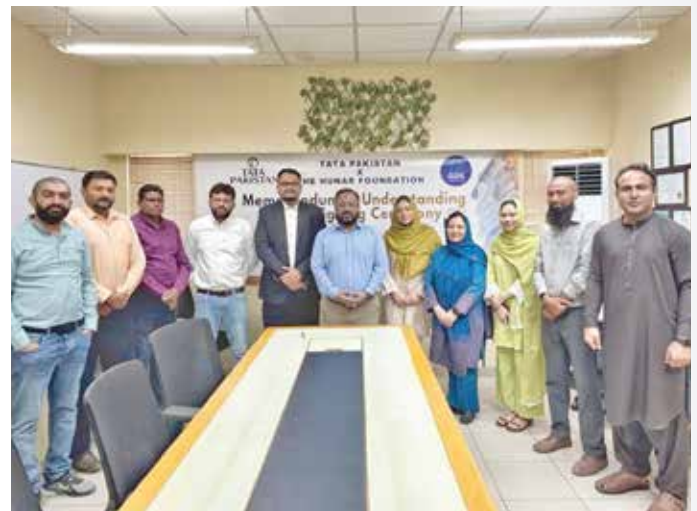
THF x Tata Pakistan

The Hunar Foundation (THF) signed a Memorandum of Understanding with HR Dost to redefine career pathways for students and alumni by connecting them with top HR professionals and industry leaders. Key initiatives include the THF - Rehbar mentorship program with 10 -15 senior HR leaders, HR meetups at THF's corporate office, on-campus guidance, industry visits, and strengthened job placement support. By combining mentorship, industry exposure, and HR expertise, this collaboration enhances employability and nurtures a skilled, confident, workforce-ready generation driving Pakistan's socio-economic growth.