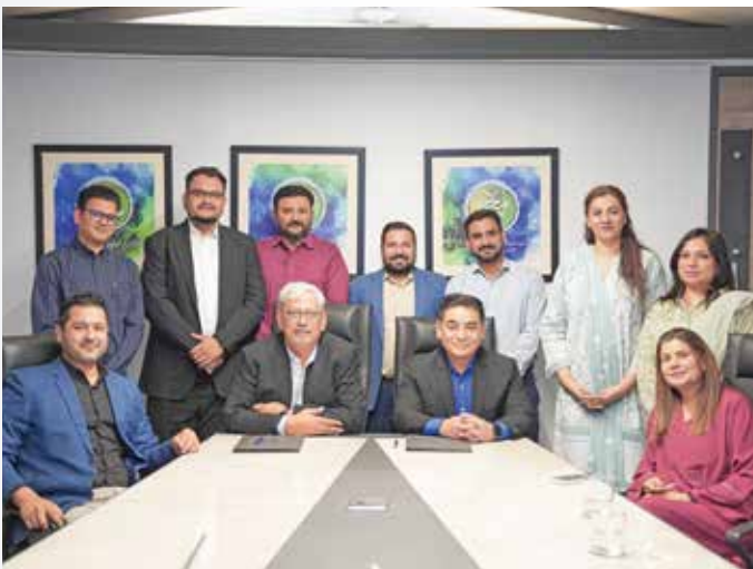
THF x HR Dost

The Hunar Foundation (THF) signed a Memorandum of Understanding with HR Dost to redefine career pathways for students and alumni by connecting them with top HR professionals and industry leaders. Key initiatives include the THF - Rehbar mentorship program with 10 -15 senior HR leaders, HR meetups at THF's corporate office, on-campus guidance, industry visits, and strengthened job placement support. By combining mentorship, industry exposure, and HR expertise, this collaboration enhances employability and nurtures a skilled, confident, workforce-ready generation driving Pakistan's socio-economic growth.